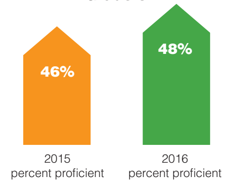
Overall English Language Arts Grade 3

The Grade 3 English Language Arts section of the West Virginia General Summative Assessment is comprised of four categories, or claims: